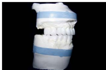
Preoperative Waxup - Right View.