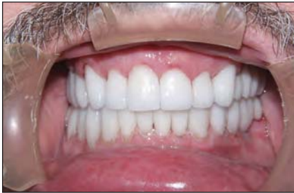
Retracted Smile After Seating.