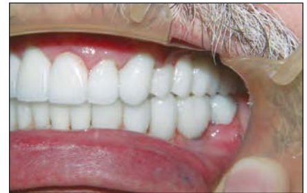
Left Side After Seating.