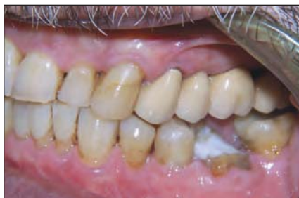
Left Side Before.