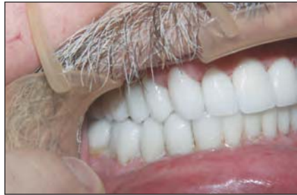
Right Side After Seating.