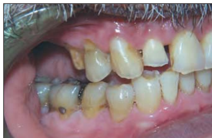
Right Side Before.