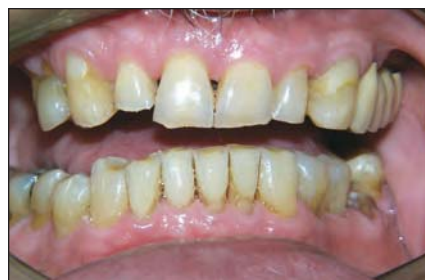
Retracted Smile Before.