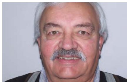
Full Face Before.