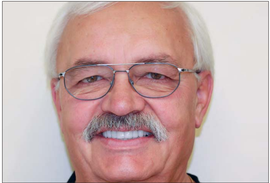
Full Face After.