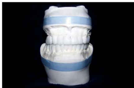
Preoperative Waxup - Front View.