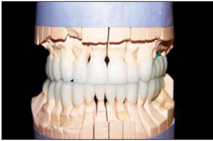
IPS Empress - Model Front.