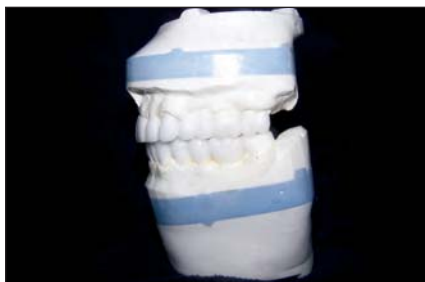
Preoperative Waxup - Left View.