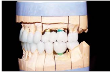
IPS Empress - Model Left.