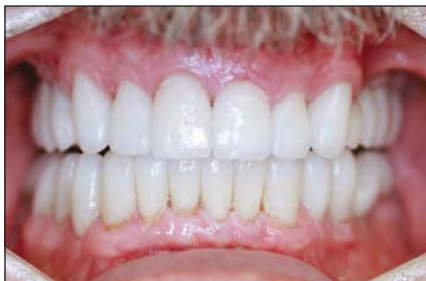
Retracted Smile After.